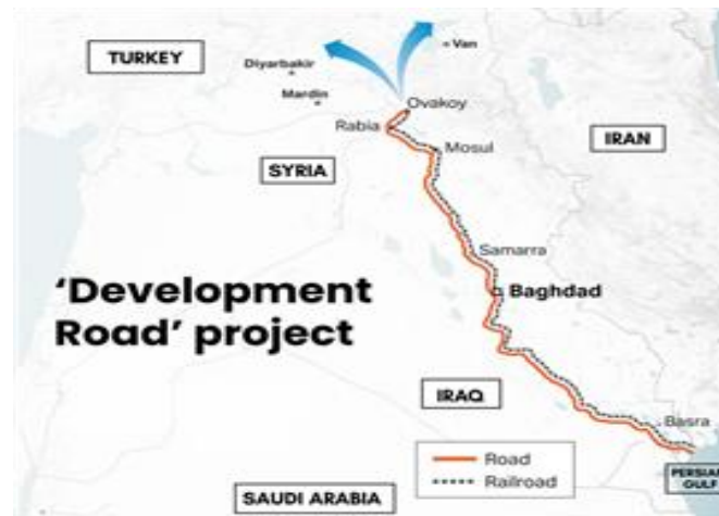
Figure (2): Development Road Project

is trying to benefit from the climate of regional calm. Especially in the wake of the Saudi-Iranian agreement (Fatemi Nejad,2023:290-313), in order to strengthen Iraq's role as a link between the various regional parties, and a meeting point instead of being an arena of conflict, while the conference hosted by Baghdad represented a remarkable occasion in terms of bringing together multiple regional parties, especially Iran and the Arab Gulf states (Unit,2023).