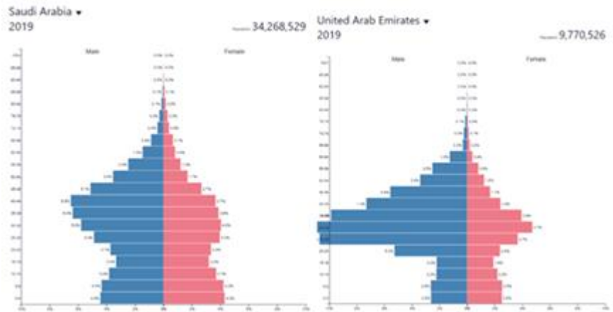
Figure (3): Population Pyramid of Saudi Arabia and the United Arab Emirates