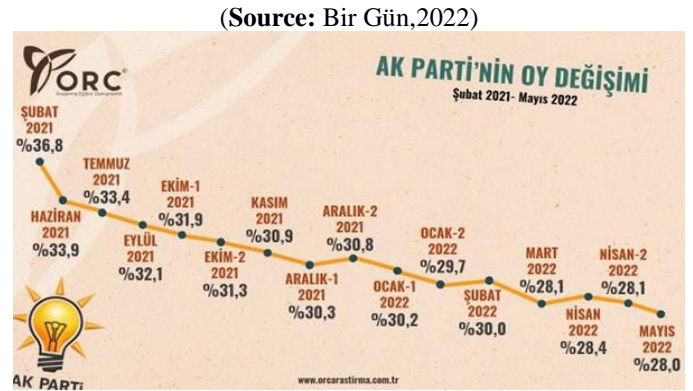
Figure (3): Votes for Justice and Development Party from February 2021 to May 2022