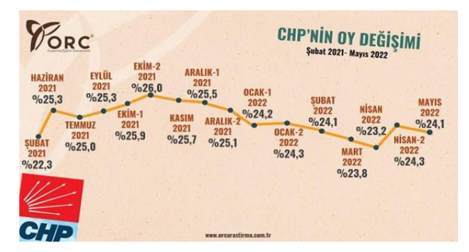
Figure (2): Votes for the Republican People's Party from February 2021 to May 2022

decreased from 36.8% in February 2021 to 28% in May 2022 (Bir Gün,2022). They are shown in the figures below.