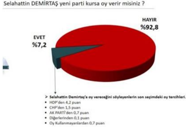
Figure (1): If Salahuddin Demirtaş Establishes a New Party, will you Vote?