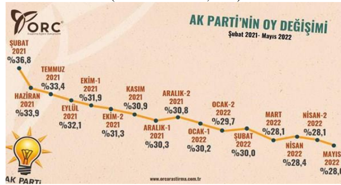
Figure (3): Votes for Justice and Development Party from February 2021 to May 2022