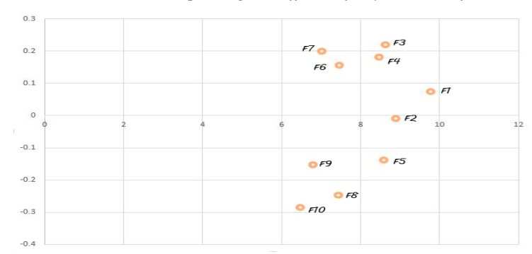
Figure (2): Cartesian Diagram of Research Factors

According to the relation map, the effect of the main factors can be obtained using a data set (D+R, D-R). In this figure, D+R is located on the X-axis, and D-R is located on the Y-axis. The results indicate that the variable that has the highest D-R value has the most impact. The more positive the D-R value is, the stronger the cause is, and the more negative the stronger the effect. The evaluation indices are analyzed according to the Cartesian coordinate diagram (Figure 2), and the research variables are ranked based on the degree of effectiveness and impact as illustrated in the tables below.