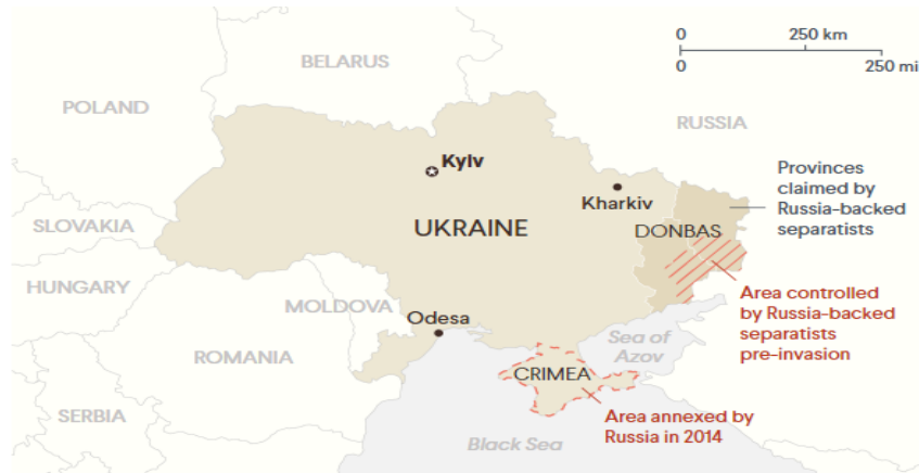
Figure (3): Ukraine Territory Map before Russian Invasion of Ukraine 2022