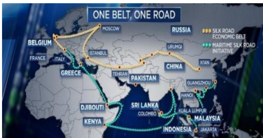
Figure (3): The Belt and Road Initiative (BRI or B & R)

11. Given the strong, stable and strategic relations between Pakistan and China, in all spheres of life, both these states have shared interests in the region in general. They support and endorse each other. The interests converge especially in the trade and energy sectors. China's dream of connectivity and shared prosperity has influenced the world in general, and the Eurasian region, Asia and Africa in particular. BRI is a project of connecting world, and it has its branches passing through Central Asia to connect the East to the West.