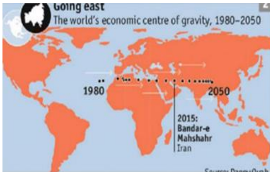
Figure (6): Map Depicting Shift in World’s Economic Center of Gravity

28. The calculation takes into account all the gross domestic products generated globally. Thus, an estimated calculus for 2050 indicates that the center moves further East, somewhere between India and China. This is how a mutual benefit relationship started between the Middle East and China (as between supplier and distributor), along the lines of energy and economics.