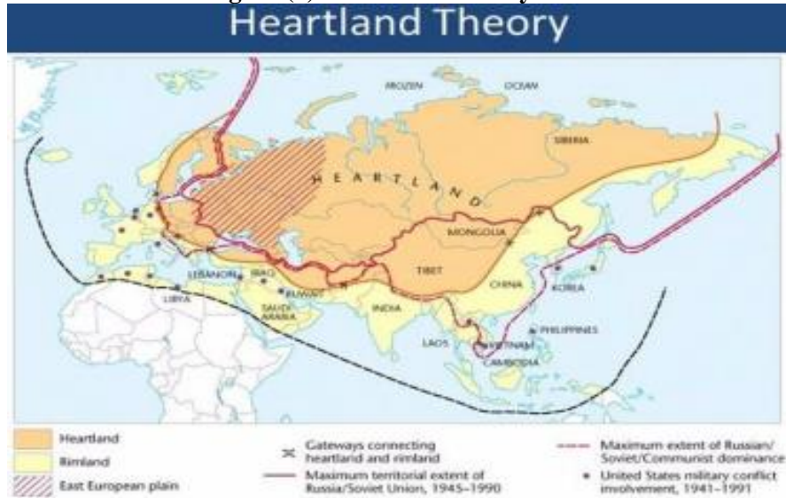
Figure (5): Heartland Theory

21. In addition, in a world without sanctions, Iran continues to have the shortest, safest and most economical way to export oil and gas from these regions to the outside world. Hence, as a land bridge, Iran connects Central Asia / the Caucasus to the Persian Gulf sub-region on the one hand and the Mediterranean / East to South Asia on the other. With this geography, there comes interdependence as Iran is directly involved and influenced by the geopolitical developments of the four sub-regions of the Persian Gulf, "the Eastern Mediterranean, Central Asia / Caucasus and South Asia". All these capacities and capabilities have made it possible for Iran to play a major transit role as the energy transit hub of the region (South and Reshined,2011), even under US sanctions.