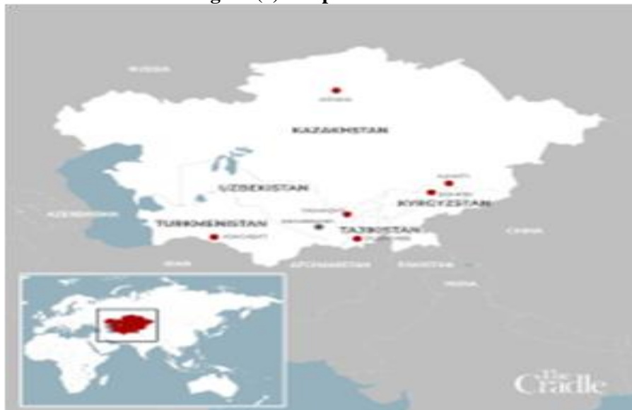
Figure (1): Map Central Asia

6. Central Asia is the center stage of new Great games. Western quest for resources; oil and energy resources are in the Central Asia. After USSR decline, new quest started which is as manifested by politics of oil. Pakistan is located very close to the oil rich Middle Eastern countries. The belt started from Iran and extended to Saudi Arabia. In the energy scarce world, Pakistan is located in the hub of energy rich countries i.e., Iran and Afghanistan; both are energy abundant while India and China are lacking. China finds way to Indian Ocean and Arabian Sea through Karakoram highway. Moreover, Pakistan through Arabian Sea is linked with the Muslims Countries of Persian Gulf.