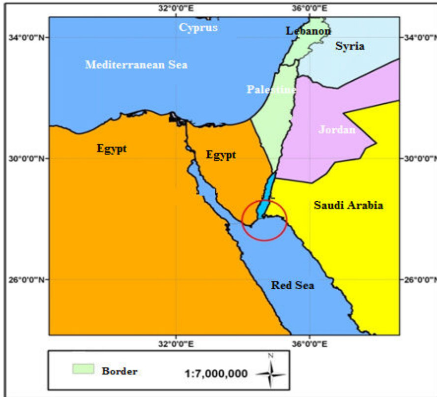
Map 1: North East of the Red Sea, Aqaba Gulf and Tiran Strait outlines

Although in this situation, this conflict has a dormant state nevertheless it's possible to raise the conflict again due to critical and hurly-burly conditions in Middle East. Emergence of popular revolutions in Arab countries such as Egypt and Jordan and increasing anti-Zionist's emotions in countries are cases which can transform Tiran Strait conflict to a critical situation again. In this research we are going to answer this question that "what is Tiran Strait's position in South west Asia conflict?"