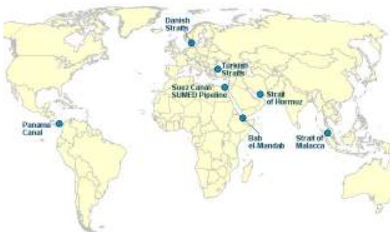
Figure 1: World Chokepoints