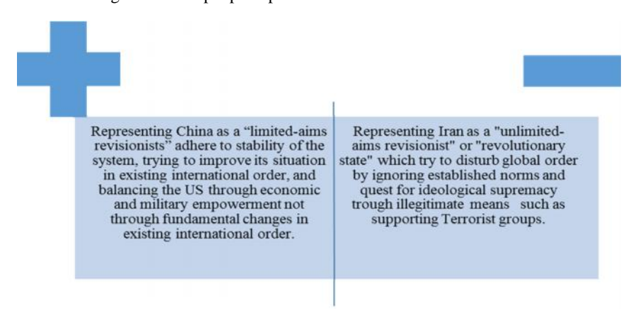
Figure 3. Trump's perception of China and Iran's revisionist behavior