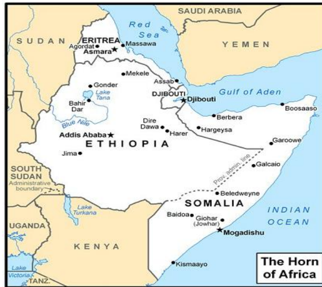
Figure (1): The geographical location of the Horn of Africa

different religions including Islam, Christian, Jewish and pagan have created a mosaic that only is united politically and strategically, and does not united and coordinated from the viewpoint of other facets. This region is limited from east and southeast to the Indian Ocean, from north to Adan Gulf and from northeast to the Red Sea (Amir Ahmadian,2002: 39-41).