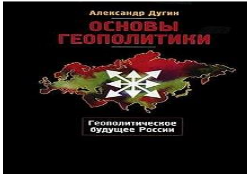
Figure (3): Cover Image of Alexander Dugin's bBook with a Russian Eurasianism Design

(Source: Wikipedia, The Foundations of Geopolitics, by Alexander Dugin, www.wikipedia.org )