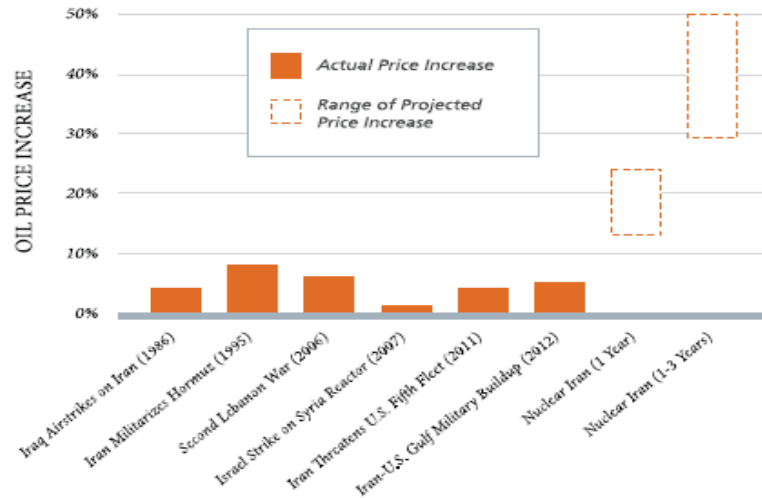
Curve 2- Oil Prices React To Instability and Crisis