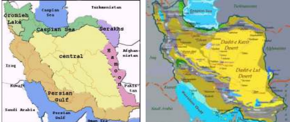
Main basins of Iran